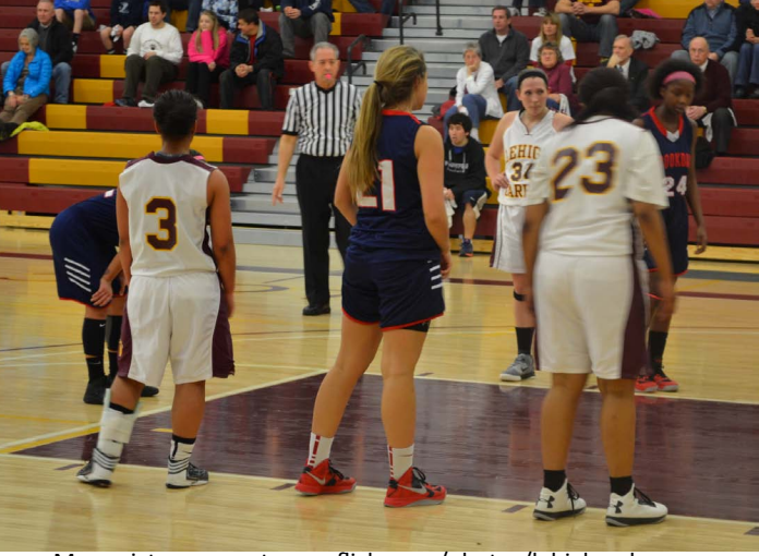
More pictures are at <a href="https://www.flickr.com/photos/lehighcarboncc.">www.flickr.com/photos/lehighcarboncc.</a>

LCCC students worked with WXLVradio.com to